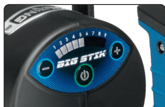
Electronic speed adjustment with LED indicator