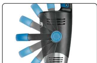
Patented pivoting second handle and comfort grip