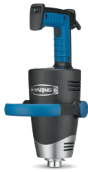
WSBPPX Heavy-Duty Big Stix® EvolutionX® Power Pack