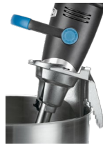
WSBBC Big Stix® EvolutionX® Immersion Blender Bowl Clamp