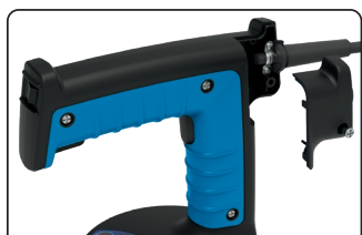
Dual-trigger handle and serviceable cord design